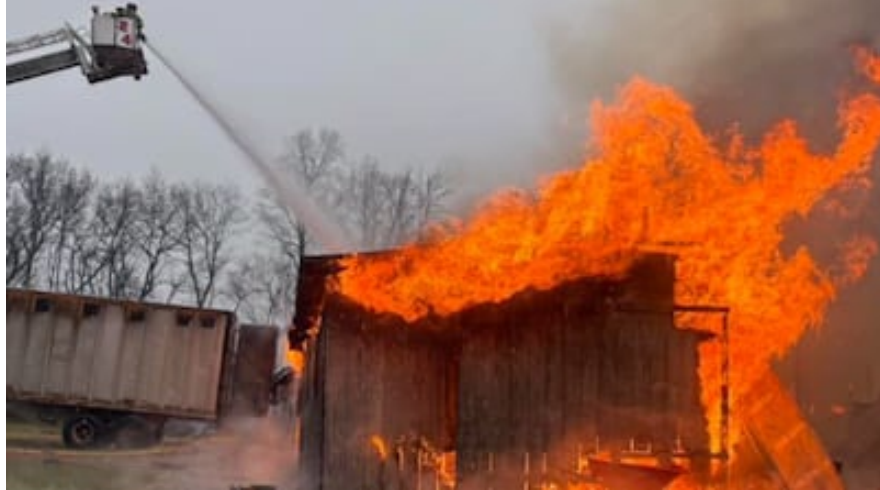
(Left) Anton Lavey, Founder of the Church of Satan. (Right) The burning barn in Randolph County.